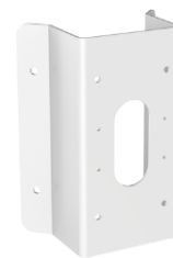
DS-1476ZJ-SUS Corner Mount