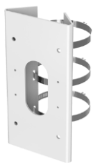
DS-1475ZJ-SUS Vertical Pole Mount